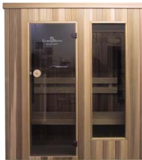
4x6 Clear Cedar or Poplar Far Infrared Thermo Cabin 43" x 70.5" x 78"