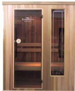
4x5 Clear Cedar or Poplar Far Infrared Thermo Cabin 43" x 61" x 78"