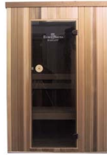
4x4 Clear Cedar or Poplar Far Infrared Thermo Cabin 43" x 53 x 78"